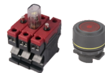
K0101-A Control button with signal lamp